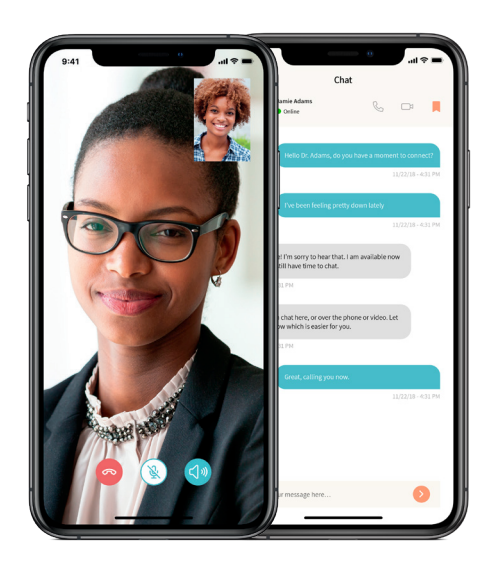
Schedule counseling sessions by chat, video, or voice