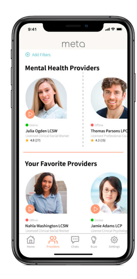
Use filters to find qualified professionals for you