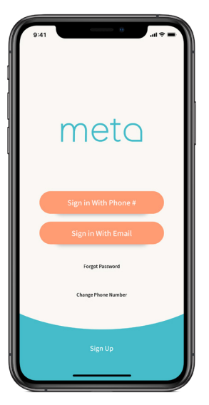
Include "Indiana Health Centers" as your company in your profile