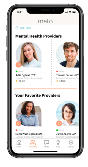
Use filters to find qualified professionals for you