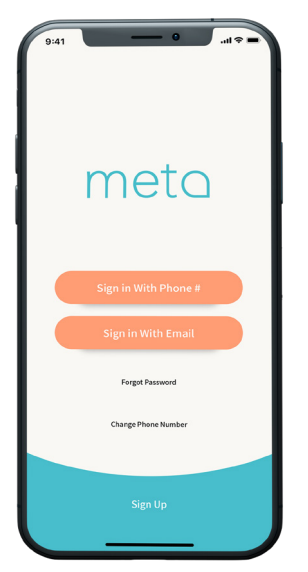
Include Jarvis Christian University in your profile