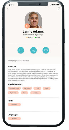
Use filters to find qualified professionals for you