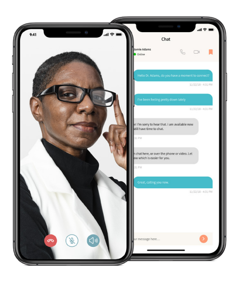
Schedule counseling sessions by chat, video, or voice