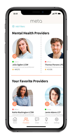
Use filters to find qualified professionals for you